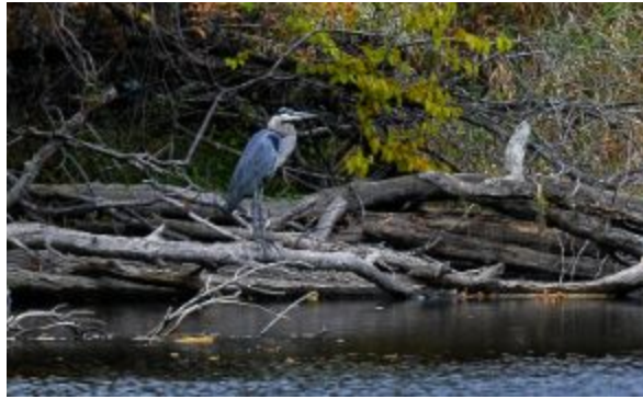
By Credit: Liam O'Leary